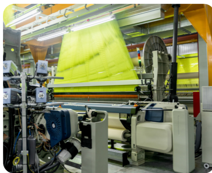
modern electric loom