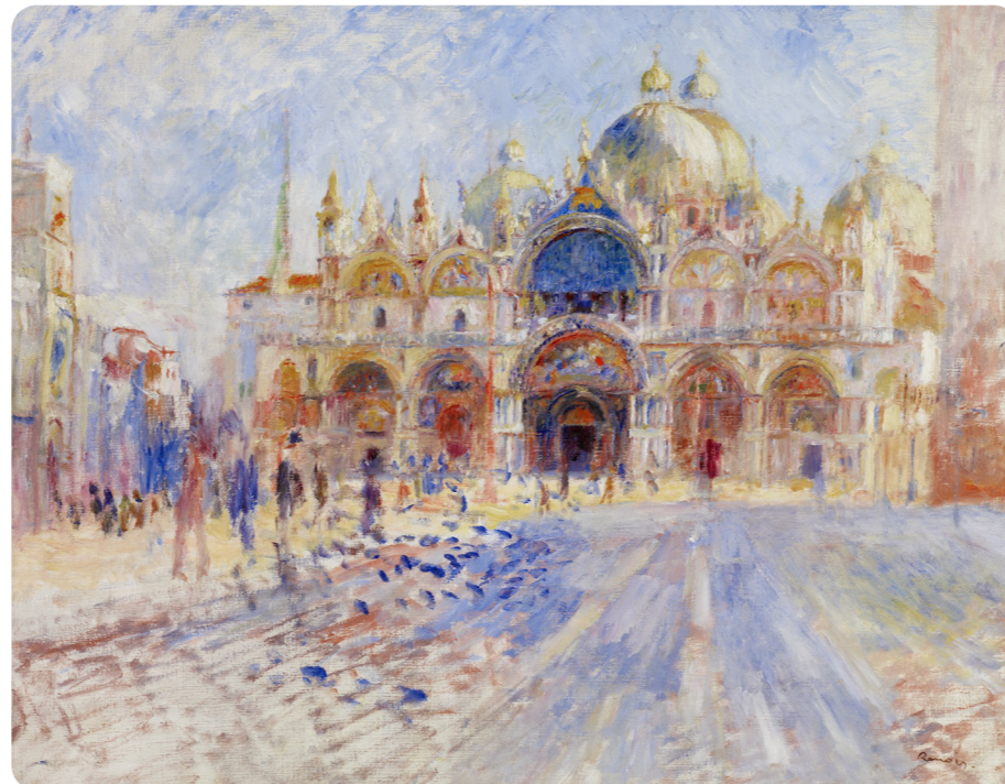
The Piazza San Marco by Pierre Auguste Renoir, 1881

In this painting by Pierre Auguste Renoir, a bright, soft colour palette is used with lots of tints to emphasise the effect of light.