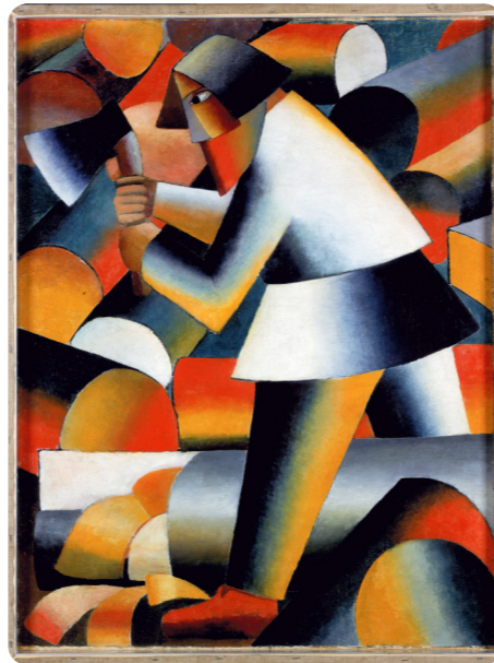
Some artworks reduce their subject matter to basic shapes, such as The Woodcutter by Kazimir Malevich.