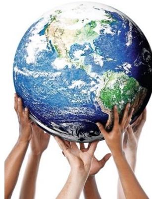
Being Me in My World Maslow's Triangle - PowerPoint Slide 1 - Ages 10-11 - Piece 3